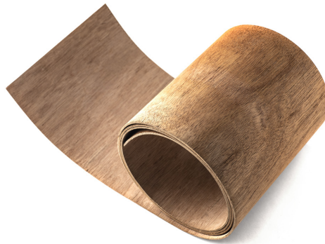
5.2mm Short Grain

Our bending plywood is architecturally designed for millwork, furniture and lamination.