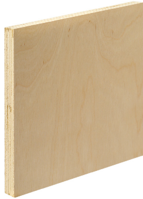
19mm Unfinished Birch

Our Birch plywood is crafted with high quality core materials sourced from Canusa certified mills. Birch is a reliable choice that is stable, strong and sure to perform in a wide range of applications, while remaining cost efficient.