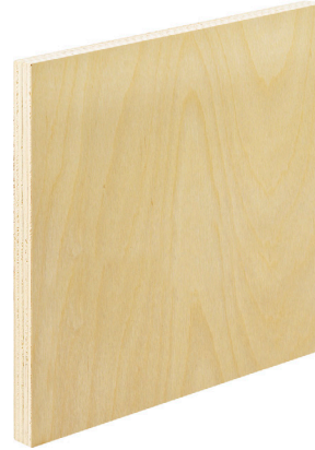
19mm Prefinished Birch