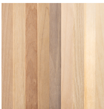
Fancy Plywood Options

Our thin fancy line includes hardwood veneers to meet any style and customer's requirements. A wide variety of face and back species are available including custom lay-up options to meet architectural specifications.