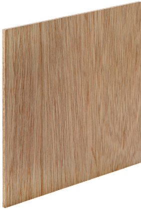
5.2mm OVL/BTR Meranti

Canusa Meranti panels are available in full Meranti core, Falcata Core and Meranti or Falcata Lumber core.