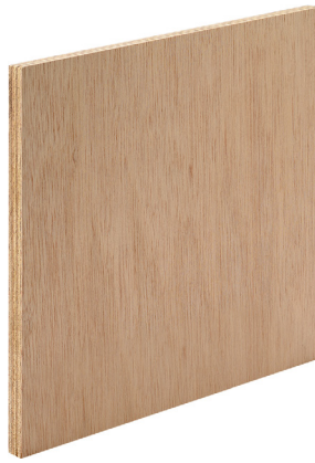
12mm OVL/BTR Meranti