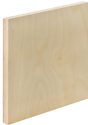
19mm Unfinished Birch

This premium plywood is crafted with the highest-grade core materials sourced from our exclusive international mills. Our experienced graders oversee the quality panel production that the PREMCORE® brand has become famous for. With over eight years of careful and continuous refinement, PREMCORE® has proven, time and again, that its quality is tough to beat for performance and value. Once our customers give PREMCORE® a try, it's hard to go back to what they used before.