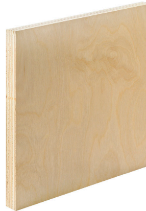
19mm Prefinished Birch