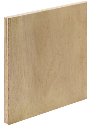
18mm B/C Exterior Glue